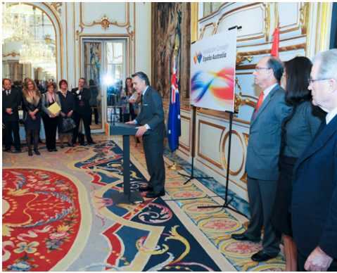
Official presentation of the Foundation at the Spanish Ministry of Foreign Affairs and Cooperation, with the presence of former Ambassador of Australia to Spain (on the right) and former Director General for North America, Asia and the Pacific of Spain (on the left). Madrid, December 2010