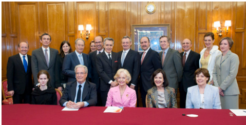
Visit to Spain of Her Excellency Quentin Bryce, Governor-General of Australia. June 2011. Left: Meeting with the Foundation's Board of Trustees. Right: Lunch offered by HRH the Prince and Princess of Asturias at the Royal Palace

The Spain-Australia Council Foundation is part of the overall framework of the Council Foundations Network, which promotes and supports the Ministry for Foreign Affairs and Cooperation, and a landmark in public-private partnerships (PPP).